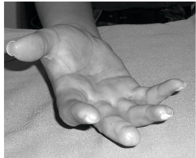
Figure 3 - Eight weeks after initiation of bosentan all ischemic changes disappeared. Nevertheless, the distal phalange of the third digit needed to be surgically removed

fibrosis in her arms and hands remains stable and she is asymptomatic under bosentan and omeprazole. 3