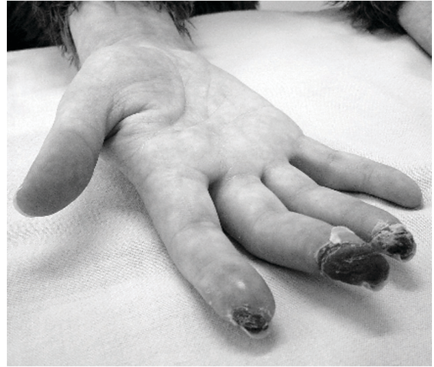
Figure 2 - Picture of the patient's right hand with diffuse edema, cyanosis of extremities and ischemic necrosis of the second, third and fourth digits. At this time, the patient had already received wound care, calcium channel blockers, prostacyclin analogues and sildenafil, but ischemic changes progressed

Bosentan – an oral endothelin dual receptor antagonist – was prescribed initially in the dose of 62.5 mg twice a day for 2 weeks and then 125 mg twice a day. Pain promptly improved as the frequency of cyanosis episodes in her fingers decreased. After 8 weeks, all signs of ischemia had disappeared. Nevertheless, the distal phalange of the third right finger needed to be surgically removed (Figure 3). After 6 months of follow-up, skin