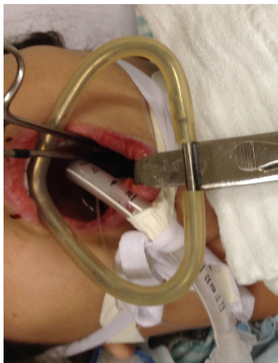
Figure 1. Patient admitted to tertiary hospital.

Selective catheterization of the facial artery was achieved using a Cook Cantata ® microcatheter and a 0.014", 300 cm Zinger Medium Medtronic ® guide wire. Embolization was achieved with a 3 mm Cook ® Nester microcoil, placed distally, and 500 µm Cook ®