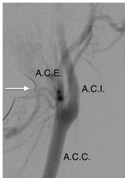
Figure 2. Arteriography of the left common carotid artery and branches (A.C.I.: Internal Carotid Artery; A.C.E.: External Carotid Artery). White arrow – probable site of pseudoaneurysm rupture, at the tip of the hemostatic forceps.