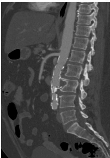
Figure 4. Postoperative sagittal angiotomography showing endoprosthesis within the aneurysm sac, excluding it, with no evidence of endoleaks.