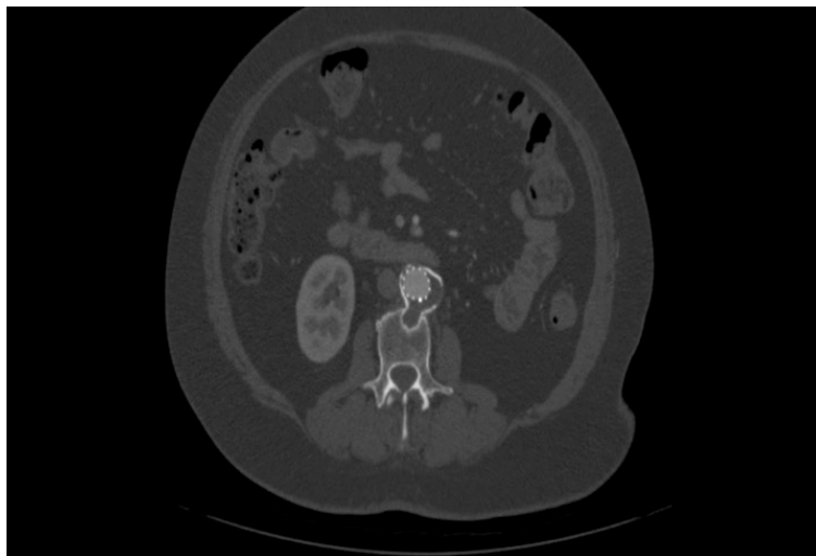
Figure 3. Postoperative axial angiotomography showing endoprosthesis within the aneurysm sac, excluding it, with no evidence of endoleaks.